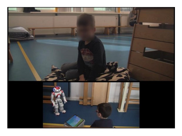
Fig. 1. Screenshot from one of the videos shown to the experts during the interview. The learning interaction is displayed from two perspectives.

preschools were children were tutored to learn animal names in a foreign language by means of a "I spy with my little eye..." game with a Nao robot. Here, up to four images of animals were displayed on a tablet screen, while the robot is referring to one of them using a Dutch description and the English name of the animal [31]. To choose the animal the robot mentioned, the children had to tap on the picture on the tablet. Two camera perspectives were recorded and presented to the experts to allow a frontal view on the child, but also a landscape view from the side on the whole experimental setup which includes the robot, the tablet and the child (see Fig. 1).